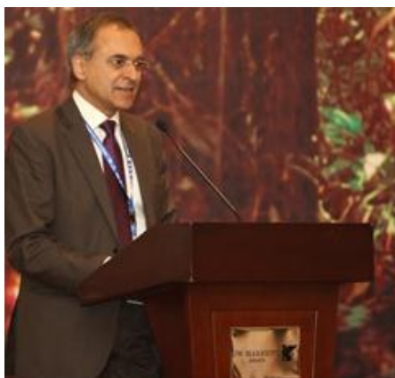
UNEP Goodwill Ambassador Mr. Pavan Sukhdev

The benefits of scaling up private sector involvement in REDD+ within a green economy are threefold: to support investment, to drive innovation, and to utilise implementation capacity . There is a need to better establish how private sector investment can build on public finance that has flowed for REDD+ and how the remaining public finance pledged to REDD+ can be best used to encourage such investments; by generating an enabling investment climate. In addition, more discussions on how innovation can be driven by the private sector are necessary, building on a growing momentum of positive change. As the largest land users with substantial skills and capacity, the role of the private sector in implementing REDD+ activities should not be underestimated. This requires more