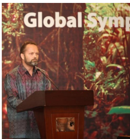
Norwegian Ambassador H.E. Amb. Stig Traavik

Some countries have taken bold steps towards REDD+ in a green economy such as in Indonesia where REDD+ forms a key component of its development strategy and commitments to a greener economy. Kenya has also taken steps to better account for the economy-wide costs of deforestation that cuts across other economic sectors. Viet Nam has defined plans to decouple GDP growth and greenhouse gas emissions by 2020 and strives for a green economy by 2050, with forestry and the importance of REDD+ explicit in these objectives. In addition to support of multilateral programmes such as the UN-REDD Programme, bilateral support has also proven important in fostering such linkages; the partnership between Indonesia and Norway, for example has played a role in Indonesia's embrace of REDD+ within a green economy.