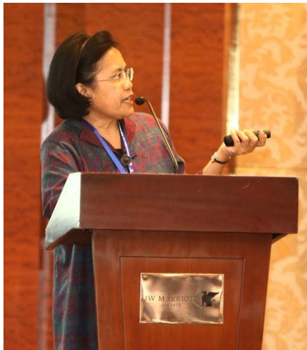
H.E. Dr. Ir. Rr. Endah Murniningtyas

Many countries have positioned their REDD+ efforts within a wider desire to move towards greener patterns of domestic growth and poverty reduction. There is much to learn in order to practically implement and integrate REDD+ within a green economy, and sharing perspectives and experiences is a useful starting point. A number of forested nations have identified national-level linkages between REDD+ and green economy approaches (Table 2). These largely relate to the social and environmental pillars of a country's national development or poverty reduction strategies and their linkages with REDD+ activities in country.