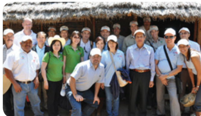
The Vietnamese delegation along with their Mexican hosts visited the forest community of Cerro Grande in Mexico.

watershed protection. This was demonstrated very effectively in a fieldvisit to the Cerro Grande in Colima state, where a community-managed forest forms the catchment for the entire water supply of 300,000 city dwellers in the state. The payments will go to the community as a whole, whose members jointly decide on how the funds will be