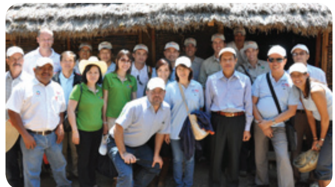
The Vietnamese delegation along with their Mexican hosts visited the forest community of Cerro Grande in Mexico.

watershed protection. This was demonstrated very effectively in a fieldvisit to the Cerro Grande in Colima state, where a community-managed forest forms the catchment for the entire water supply of 300,000 city dwellers in the state. The payments will go to the community as a whole, whose members jointly decide on how the funds will be