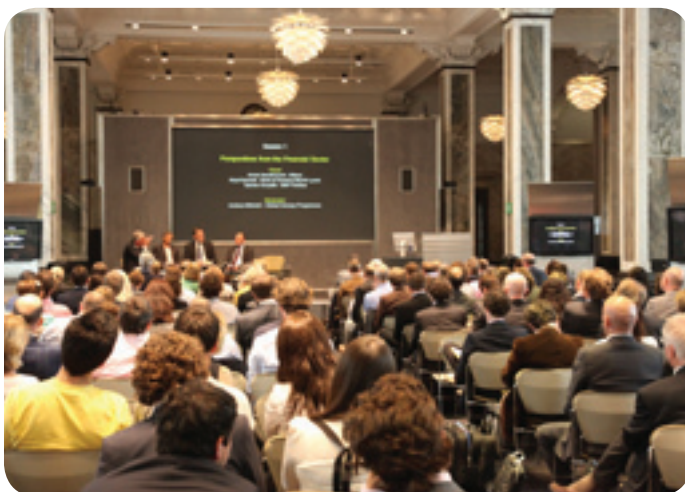
Over 200 participants, including a range of stakeholders from the financial sector, government and civil society organizations attended the launch of UNEP FI's report at the Bank of America Merrill Lynch's European headquarters in London.

The report stresses how private sector participation in REDD+ and deforestation activities can lead to a win-win scenario for the finance sector and governments, since such projects can translate into both lucrative investment opportunities and cost-effective strategies to abate carbon emissions and protect biodiversity and livelihoods.