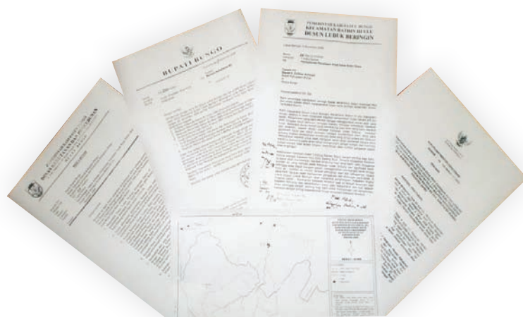
Figure 3. A sample of the various approvals and support letters needed

interested in forestry issues at the district capital prepared the ground for administrative approval by discussing how rubber agroforests can perform forest functions and deserve policy support. An NGO active at local, provincial and national level assisted in the necessary 'bridging' forms of social capital, while international research agencies added credibility to local claims that environmental services can be maintained in a rubber agroforest context. Such a process of trust building, however, takes many years and cannot be readily substituted by fast track replication efforts. The existing case can, however, become a learning site for allaying fears of those involved in the approval process.