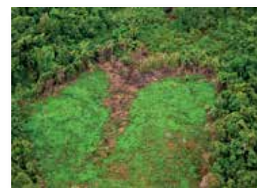
Priority benefits of REDD+, according to national stakeholders, include: ecotourism; climate regulation; biodiversity conservation; and soil erosion control.