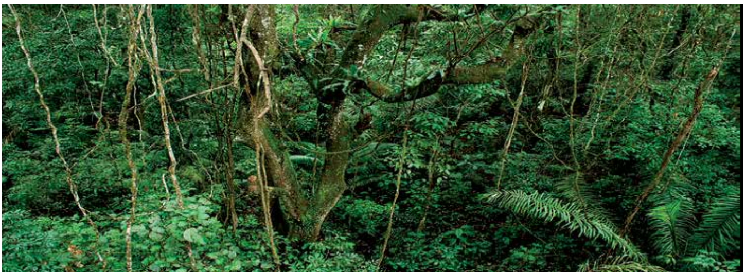
Deforestation in Panama threatens a range of important ecosystem services.

In Panama, detailed scenario-based modelling by the Tropical Agricultural Research and Higher Education Center (CATIE), has been used to project the distribution of future deforestation (to 2028) under different development pathways. Priority areas for REDD+ actions may be locations where both deforestation risk and the potential for multiple social and environmental benefits are high.