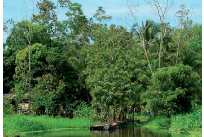
REDD+ actions can help to deliver additional social and environmental benefits beyond climate change mitigation alone.

National stakeholders developed a list of prioritized benefits from REDD+ in Panama, based on potential to generate investment and contribute to quality of life, as well as relevance for Panama's national development strategy. The priorities identified include support for biodiversity conservation and tourism, and soil erosion control.